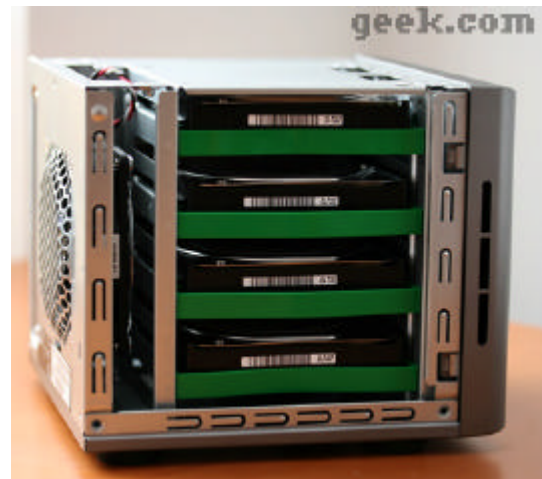
4 in 1 Docking Station