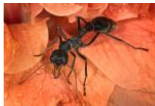
Ant On Red Flower