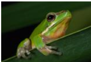
Green Tree Frog

Roy commented that a photographers often chooses to do Macro photography so as to reveal and explore a world that is often missed by our human eye. Roy acknowledged that he specialises in close-up photography of nature but he concluded his presentation by showing examples of his creative and altered reality images that were based on macro photographs. Roy also had a print display of some samples of his award winning close-up nature prints with excellent detail.