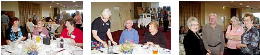
Around the Tables with members and their Guests.

The Evening commenced at 6.30pm when the doors were opened to allow the members into the Room. This allowed the members and their guests time to catch up, view the Exhibited Prints and select their tables for the dinner.