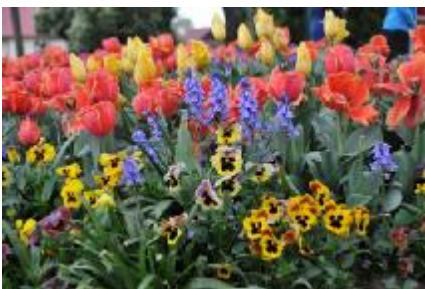
Tulip Flora Display, Bowral

Nothing ventured, nothing gained as the saying goes, so let's hope our next Camera Club outing is better attended as there is a lot to be gained from just good comrade if nothing else. In our case it was a bonus, as we got both, having the good photos too!!! Dawne Harridge.