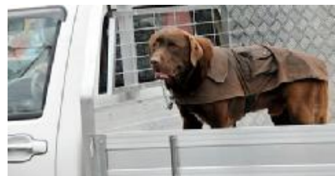
Latest Fashion For The Fashion Conscience Dog